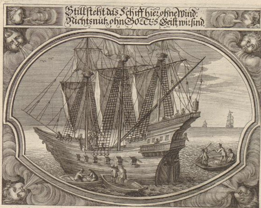
G. Strauch del.

Solche wird beschrieben / von dem heiligen Apostel Paulo / in der 1. an die Corinthier / im 15. Cap. Vers 1. -- 10.